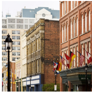
KITCHENER IN ONTARIO, CANADA (population: 257,000)