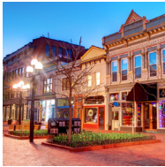
BOULDER IN COLORADO, USA (population: 108,000)