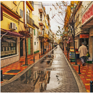
FUENGIROLA IN ANDALUSIA, SPAIN (population: 75,000)

The benefits of smart streetlighting systems are not unique to major metropolitan districts. Smaller cities can just as easily benefit from the cost savings, carbon accounting, and infrastructure backbone, as evidenced by projects underway in these three cities: